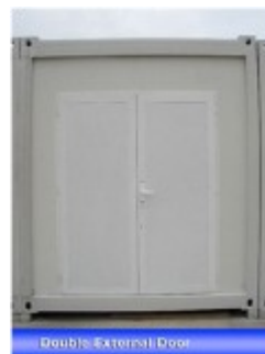
Double external Door