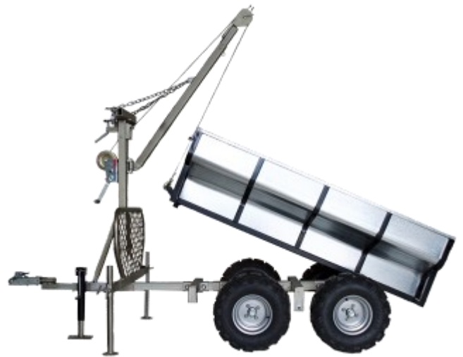
ATV Trailer - Dump with Crane Winch -1000KG