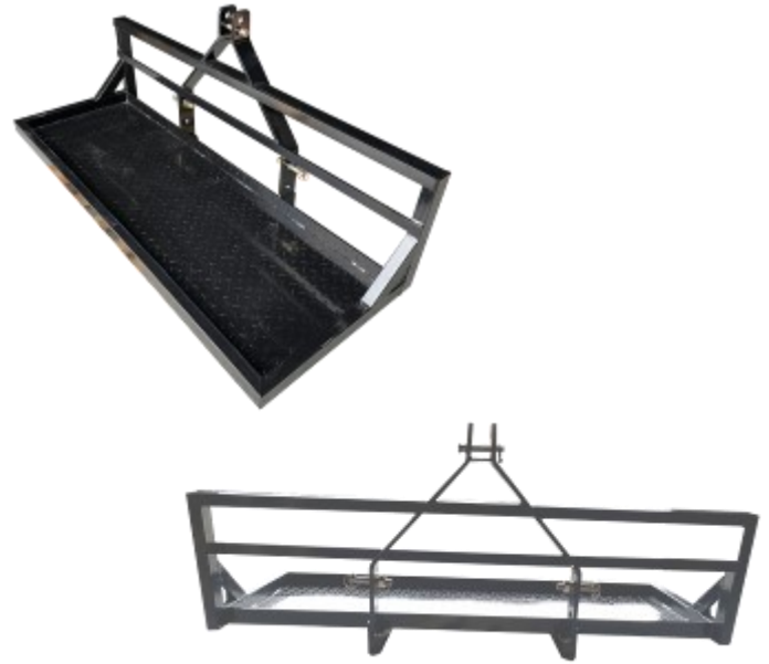
Tractor Tray - 1800(L) x 680(W)mm (6FT)