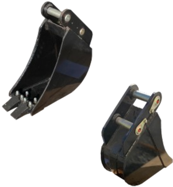
Trenching Bucket - 225mm