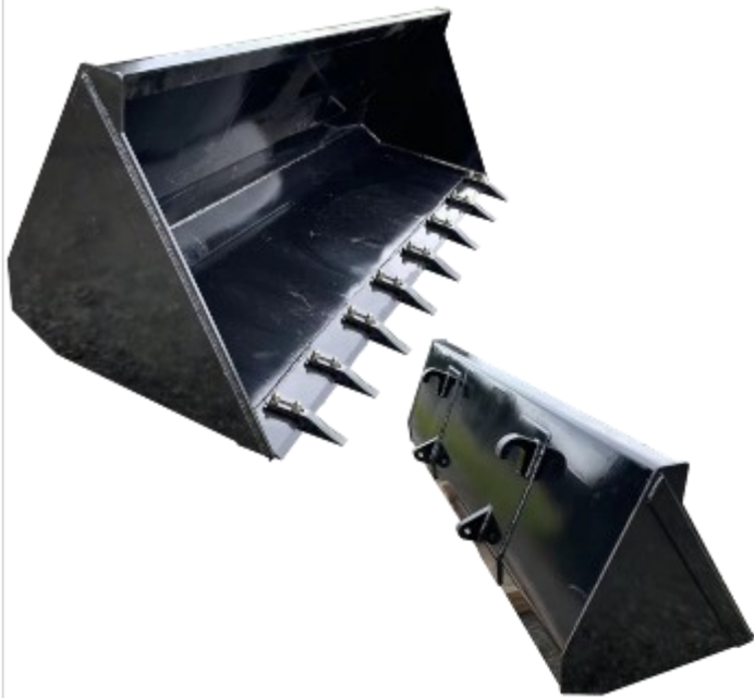
Tractor Bucket - Euro Hitch - Length: 2200mm