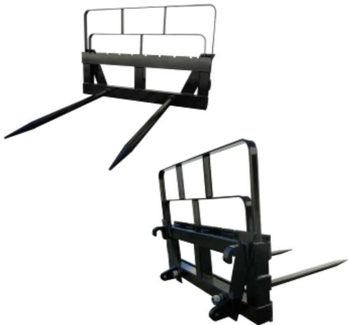
Tractor Bale Spikes - Euro Hitch - 25-100HP