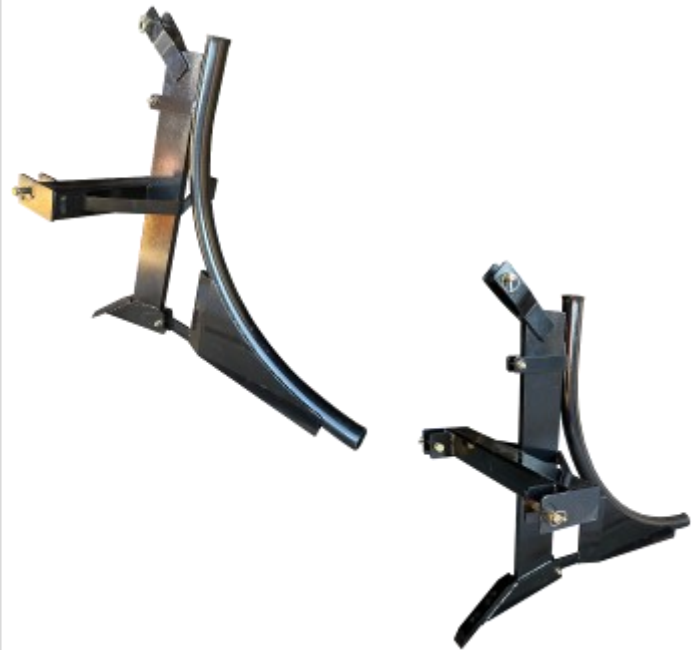
Ripper - Single Tine with Pipe Layer Attachment

Model: TZ10D-BUCKET Operating Weight: 1000kg Distance Between Teeth: 280mm (Centre to Centre) Teeth: 8 Steel Plate Thickness: 10mm Hitch Type: Euro Overall Size: 2200(L) x 615(W) x 650(H)mm Weight: 205kg