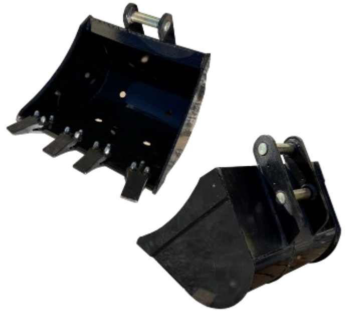
Trenching Bucket - 590mm

Model: TRENCHING BUCKET - 225MM WIDE Distance Between Mounting Pins: 155mm (Centre to Centre) Mounting Pins: Diameter: 34.8mm (Centre to Centre) Teeth: 2 Overall Size: 510(L) x 225(W) x 515(H)mm Weight: 33kg