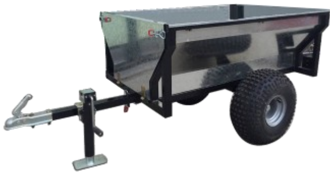
ATV Trailer - Dump - 500KG