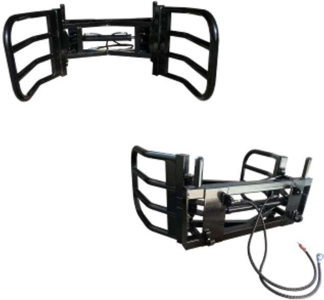
Tractor Bale Grabber - Euro Hitch - 70-80HP