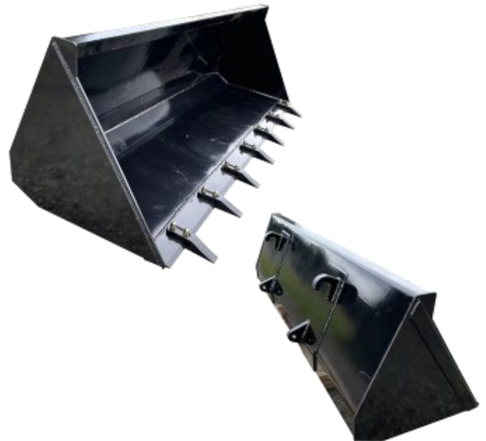
Tractor Bucket - Euro Hitch - Length: 2000mm

Model: TZ07D-BUCKET Operating Weight: 400-800kg Distance Between Teeth: 275mm (Centre to Centre) Teeth: 6 Steel Plate Thickness: 10mm Hitch Type: Euro Overall Size: 1700(L) x 750(W) x 580(H)mm Weight: 158kg