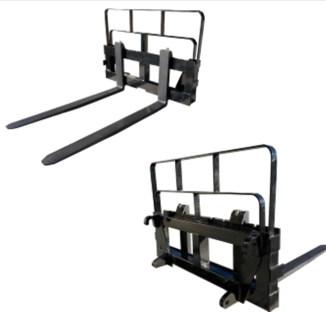
Tractor Pallet Forks - Euro Hitch - 25-100HP