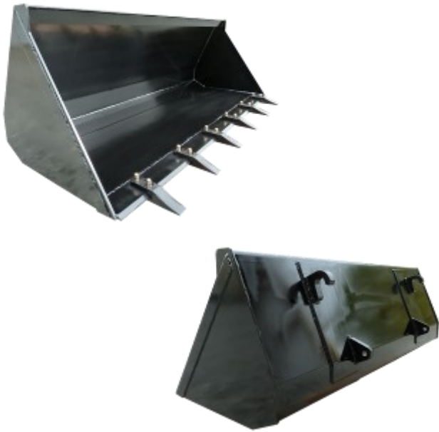
Tractor Bucket - Euro Hitch - Length: 1700mm